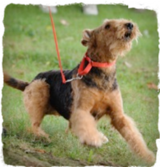
We've got something to bark about!

So read on for a preview of our developing plans for the 30 th HWA Airedale Field Nationals. You are cordially invited to come be a part of it.