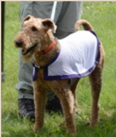
Two styles of dog cooling vests.

What's a cooling vest? Some of the latest cooling vest styles work by soaking the vest in cold water, then wrapping it snug around the dog's body. Cooling effects last for hours. This is particularly useful if you're waiting your turn in a blind or during training sessions. The vest is removed when the dog is working, but will keep its cooling effects for when the dog is done. Searching for "dog cooling vests" online will bring up several styles to choose from.