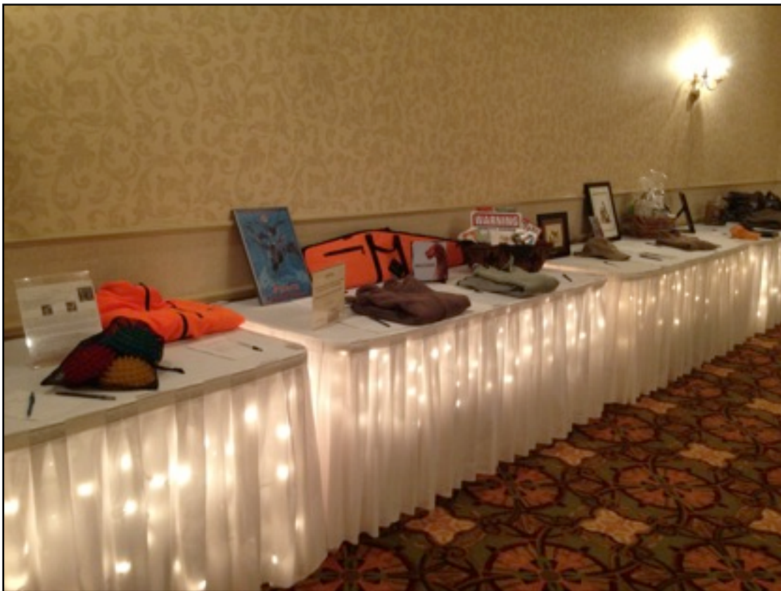
HWA Nationals Auction - just part of the array

Then come with some cash or a check and get ready for some great shopping!